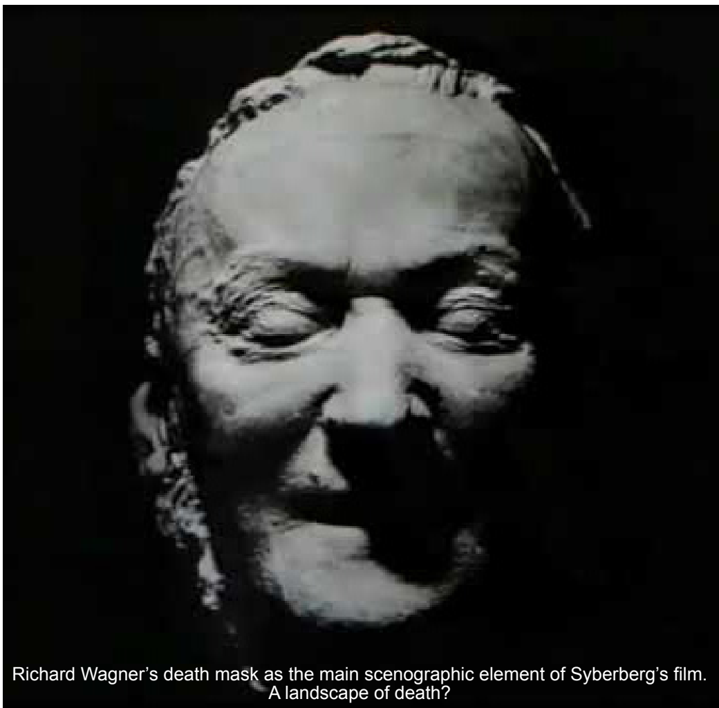
Richard Wagner's death mask as the main scenographic element of Syberberg's film. A landscape of death?