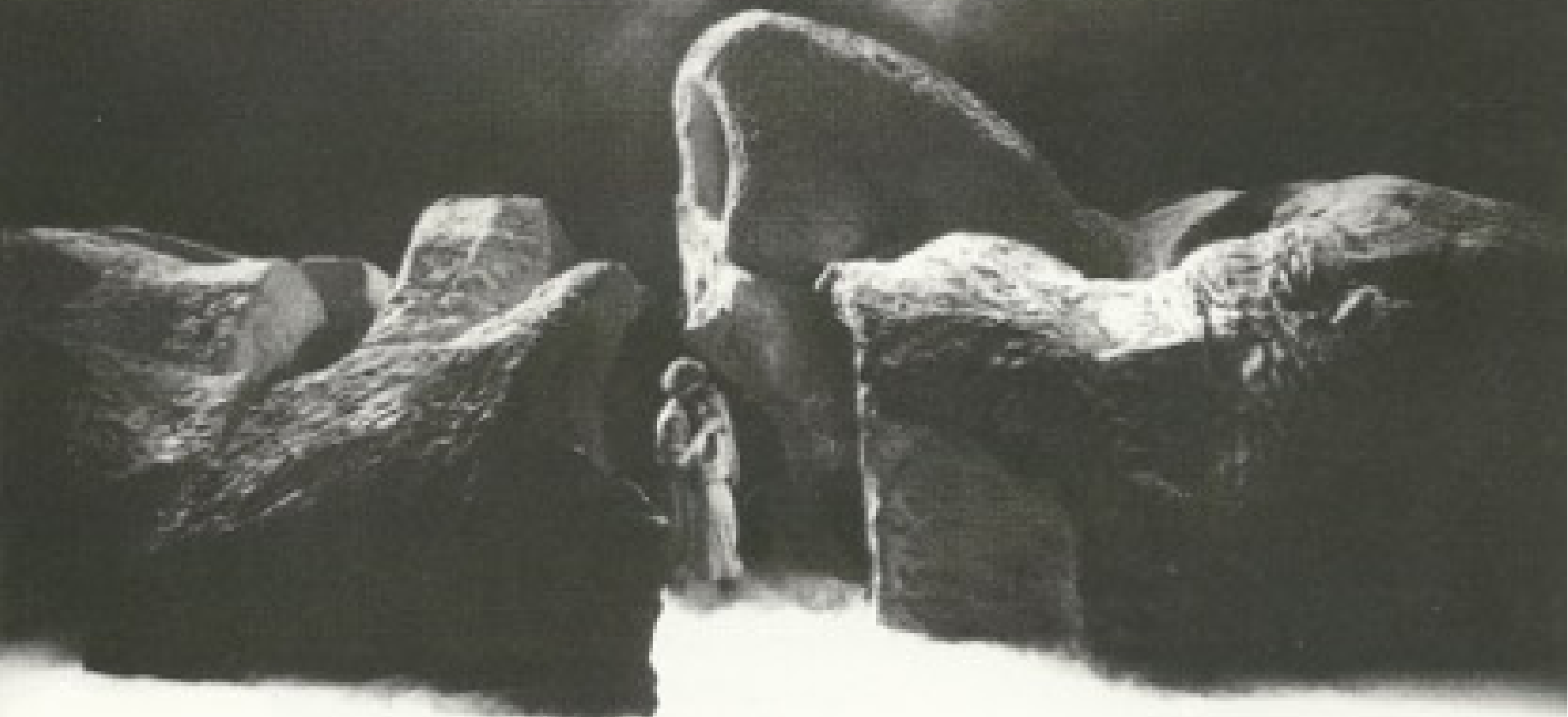
Main picture is a still from the film with the two Parsifals embracing in the Wagner death mask set. Above, three photos from the filming of Parsifal .