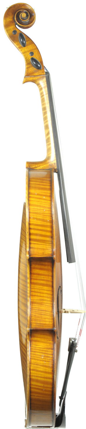
Ritter viola, Viola alta, Markneukirchen, circa 1910