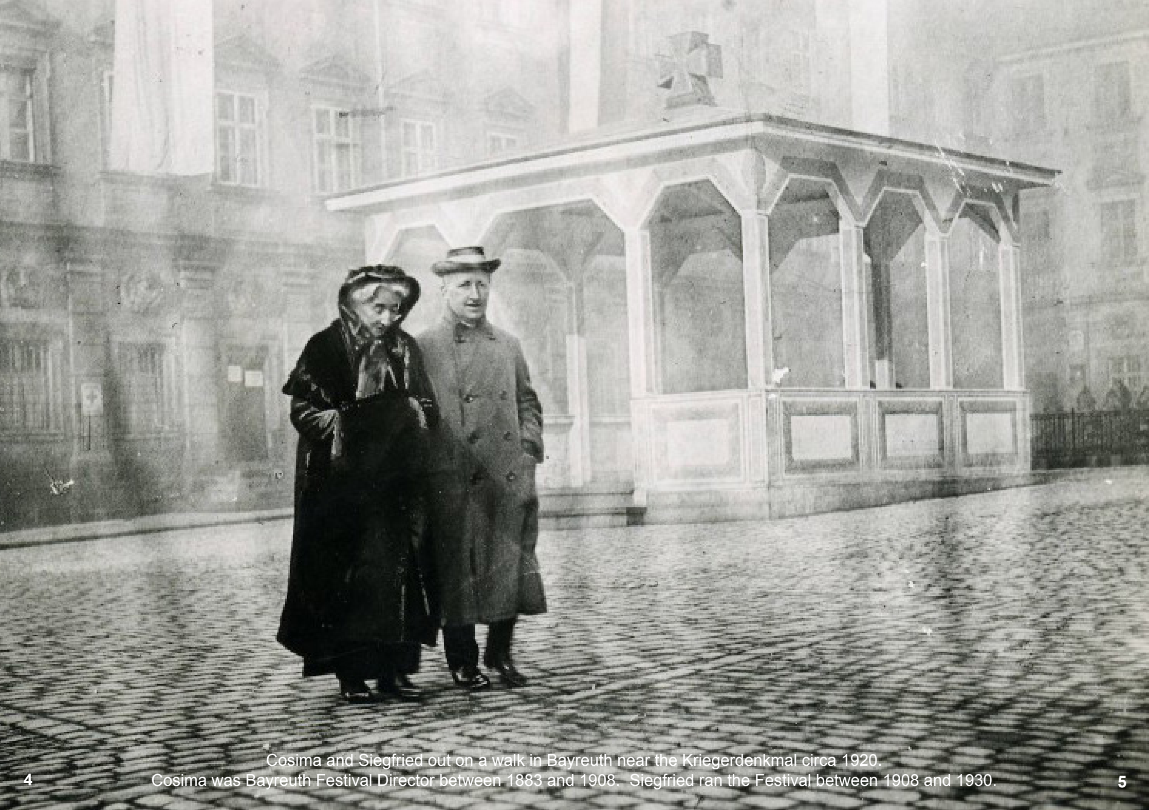
Cosima and Siegfried out on a walk in Bayreuth near the Kriegerdenkmal circa 1920.

Cosima was Bayreuth Festival Director between 1883 and 1908. Siegfried ran the Festival between 1908 and 1930.