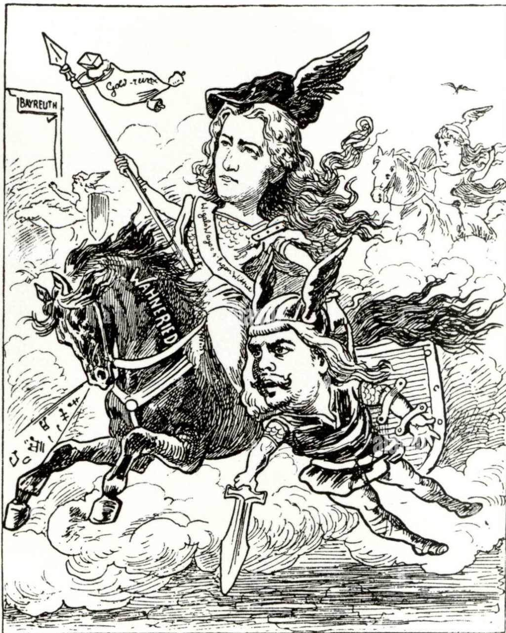
Caricature of Cosima Wagner dressed as a character from Wagner's opera Die Walküre from the Ring of the Nibelungen Cycle. 'Frau Cosimas Walkürenritt' (Miss Cosima's Ride of the Valkeries) Cosima pictured as Brünnhilde, carrying Ernst van Dyck as Siegmund.