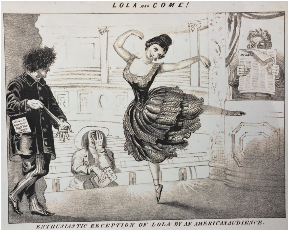
Two caricatures by David Claypoole Johnston from 1851-2.