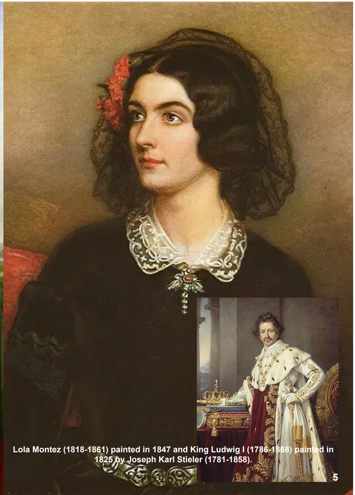
Lola Montez (1818-1861) painted in 1847 and King Ludwig I (1786-1868) painted in 1825 by Joseph Karl Stieler (1781-1858).