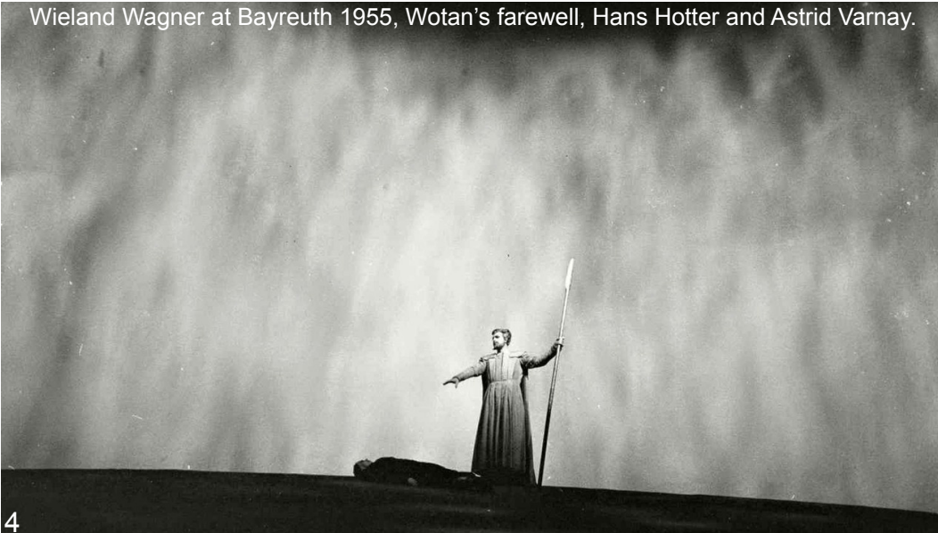
Wieland Wagner at Bayreuth 1955, Wotan's farewell, Hans Hotter and Astrid Varnay.