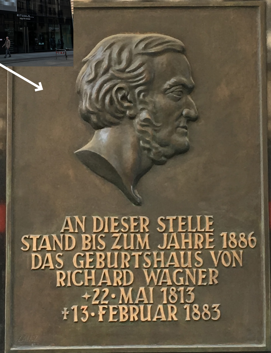
Left: No.3 the Brühl (The House of the Red and White Lions) in the then Jewish quarter of Leipzig where Richard Wagner was born on 22 May 1813. Right: The Brühl house no longer exists (it is a modern commercial building, see inset) but there is a plaque commemorating the Master's birthplace.