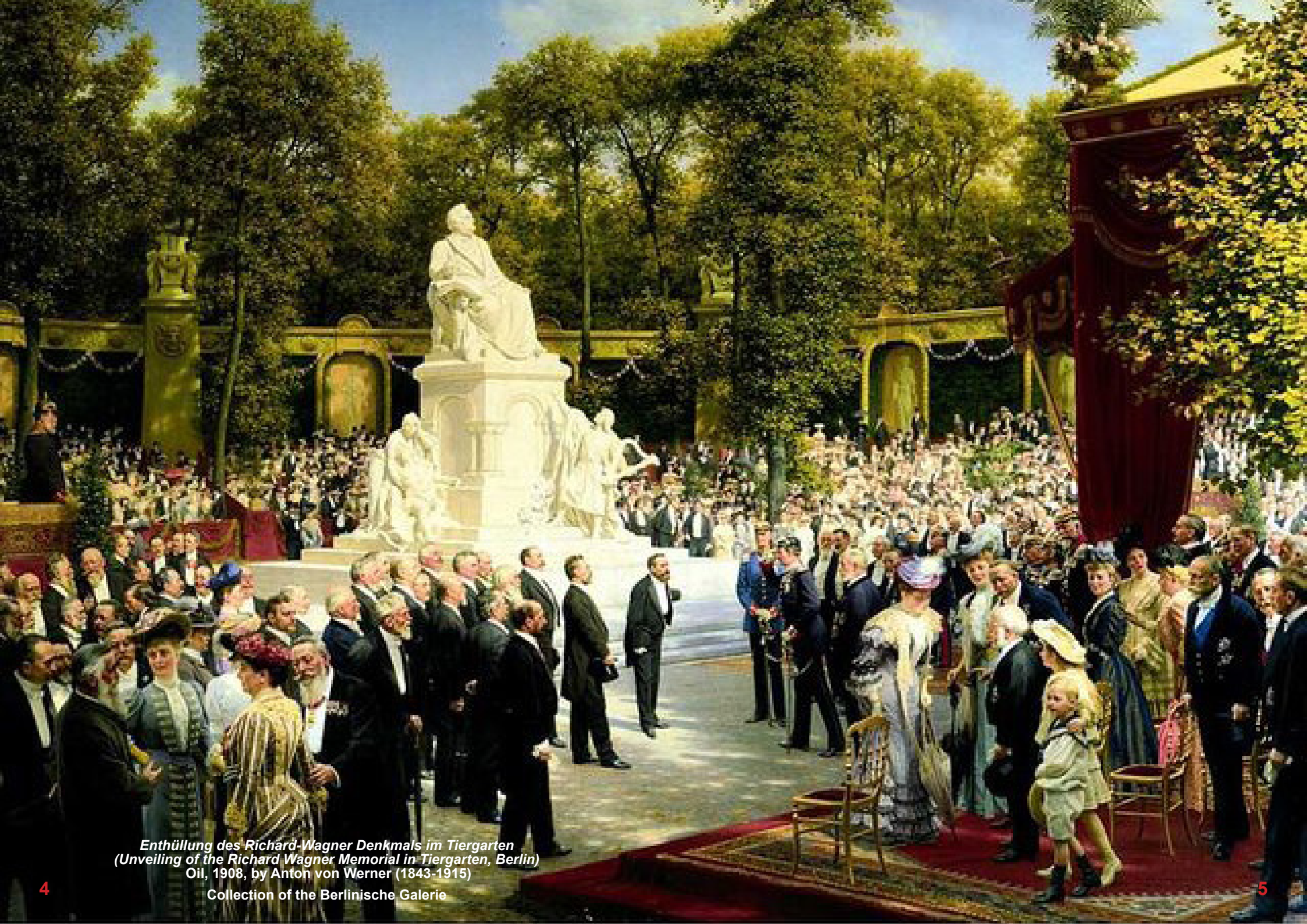
Enthüllung des Richard-Wagner Denkmals im Tiergarten (Unveiling of the Richard Wagner Memorial in Tiergarten, Berlin) Oil, 1908, by Anton von Werner (1843-1915)