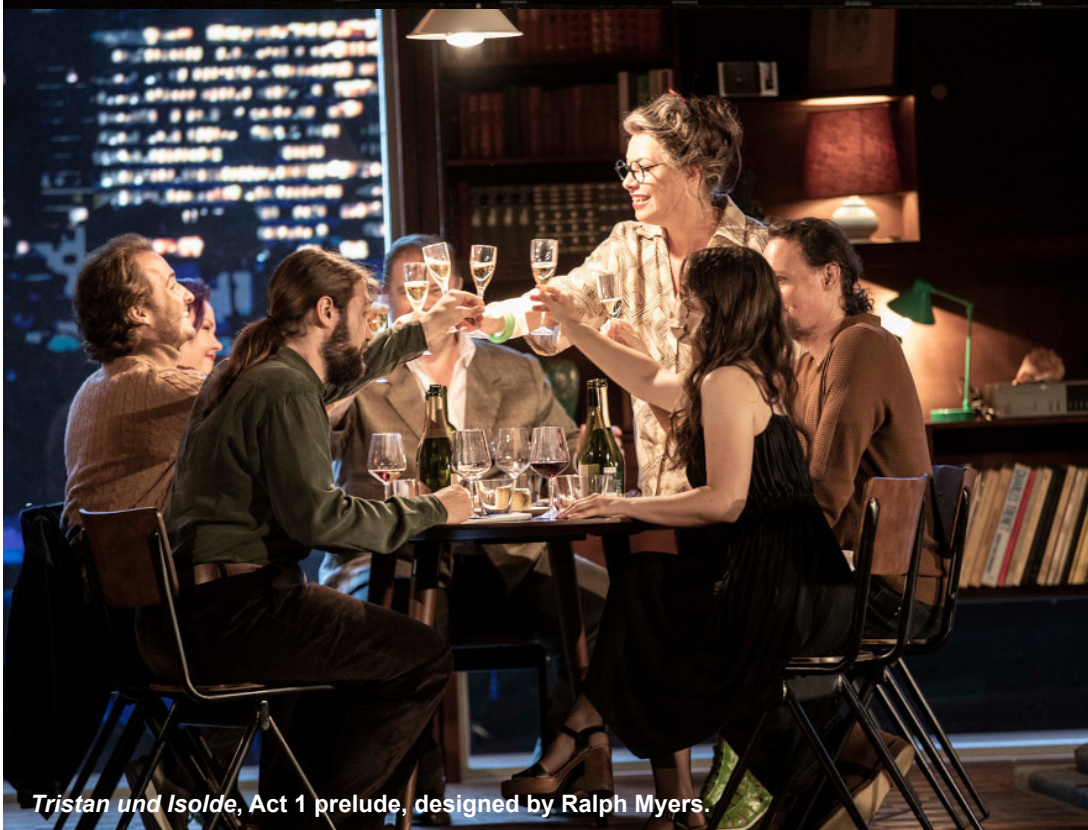
Tristan und Isolde, Act 1 prelude, designed by Ralph Myers.