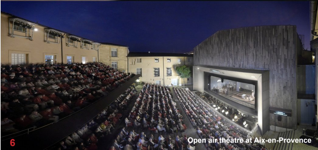
Open air theatre at Aix-en-Provence