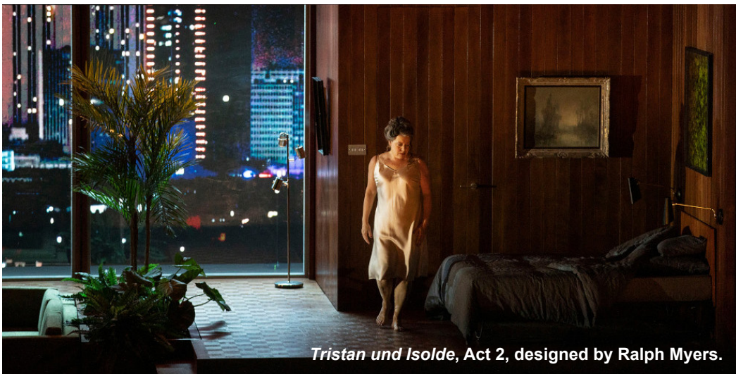
Tristan und Isolde, Act 2, designed by Ralph Myers.