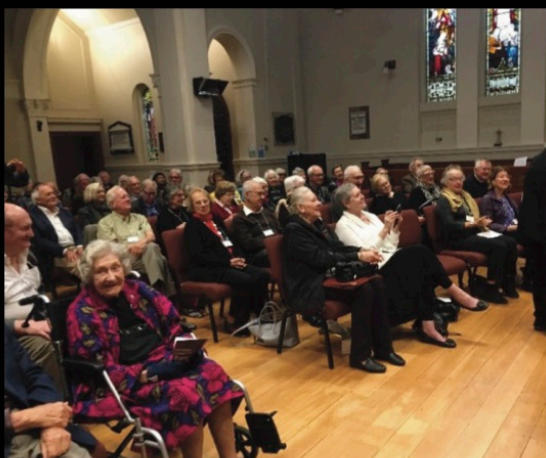
Iconic contralto Lauris Elms AM OBE in the audience