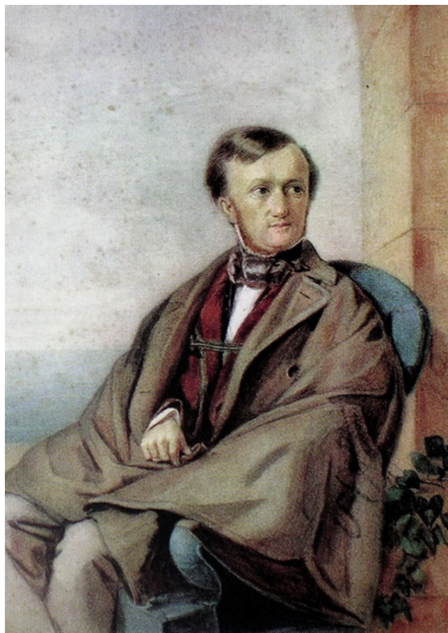
Wagner in 1853 aged 40